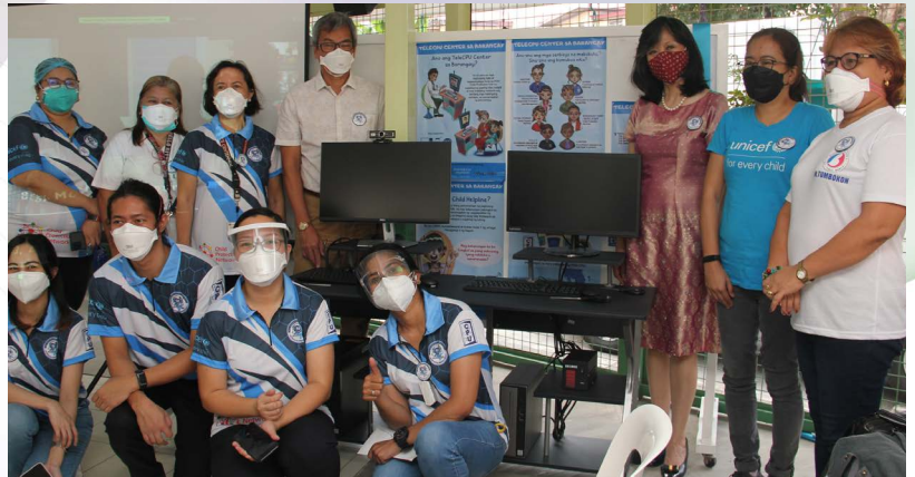
The inauguration of the TeleCPUs in the Barangay held at the PGH-CPU patient service area.

We do not know when this pandemic will end, but let us approach the future with hope and fortitude. Our community has withstood the onslaught of coronavirus; and with God's grace, we have been strengthened to face whatever challenges there are tomorrow!