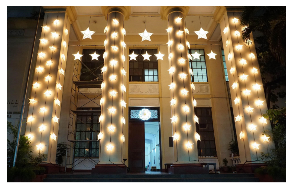
The UPCPH facade at Lara Hall was all lit with the lanterns corresponding to cash donations from the UPCPH community